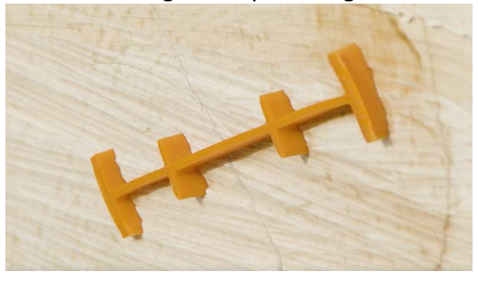
Don't hit again!

The split stopper must penetrate 100% of the wood with the first hit, don't hit again! Risk of breakage and splintering!